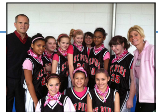
7 th Grade Girls JV Team supporting Breast Cancer Awareness

away by all of our teams. Our fans, players and coaches all rocked their pink. We saw everything from pink beards, to homemade socks and shoelaces to pink hair! And hopefully you all had a chance to see the beautiful decorations that transformed our gym. Our commitment and dedication to our community is evident here at St. Pius X School. Thanks to your generosity, SPXAA donated $1,298.18 making St. Pius X School the winner of this year's event by a landslide! Congratulations Pirates!